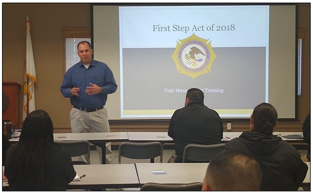
TRAINING. BOP Unit Managers receive training at the FCC Victorville Complex in Victorville, CA.

Training is a third key to successful implementation. BOP has already deployed a comprehensive training program for relevant program areas responsible for portions of the risk assessment process.