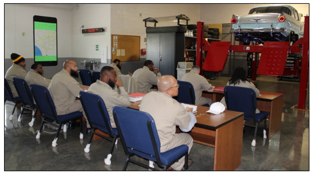
WORK PROGRAMS. Inmates learn how to properly perform a four-wheel vehicle wheel alignment as part of an automotive chassis vocational program at FCI Bennettsville.

The Department tested the updated version of PATTERN to ensure that individuals could successfully move from a higher to a lower risk score. The examples in Attachment A show how different types of inmates can use the dynamic factors in the updated PATTERN to lower their risk score and how a motived inmate's risk score will improve compared to an unmotivated inmate who does not thoroughly complete evidence-based recidivism reduction programs.