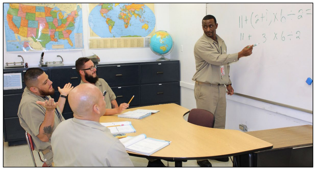
EDUCATION. BOP inmates participate in a GED program.

10. The Department received feedback expressing concerns about BOP's programming capacity, as according to the July 2019 Report, very few inmates appear to participate in programming. In response to that feedback, the Department is clarifying the data in the July Report and is providing an update on some of the efforts to expand programming.