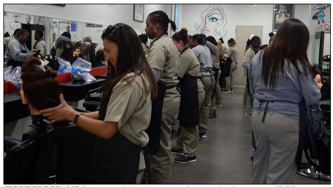
WORK PROGRAMS. Inmates participate in a cosmetology vocational program at FPC Bryan.

The approved FY 2020 budget for DOJ from both the House and the Senate provides seventy-five million dollars ($75 million) for FSA implementation activities.<sup>17</sup>