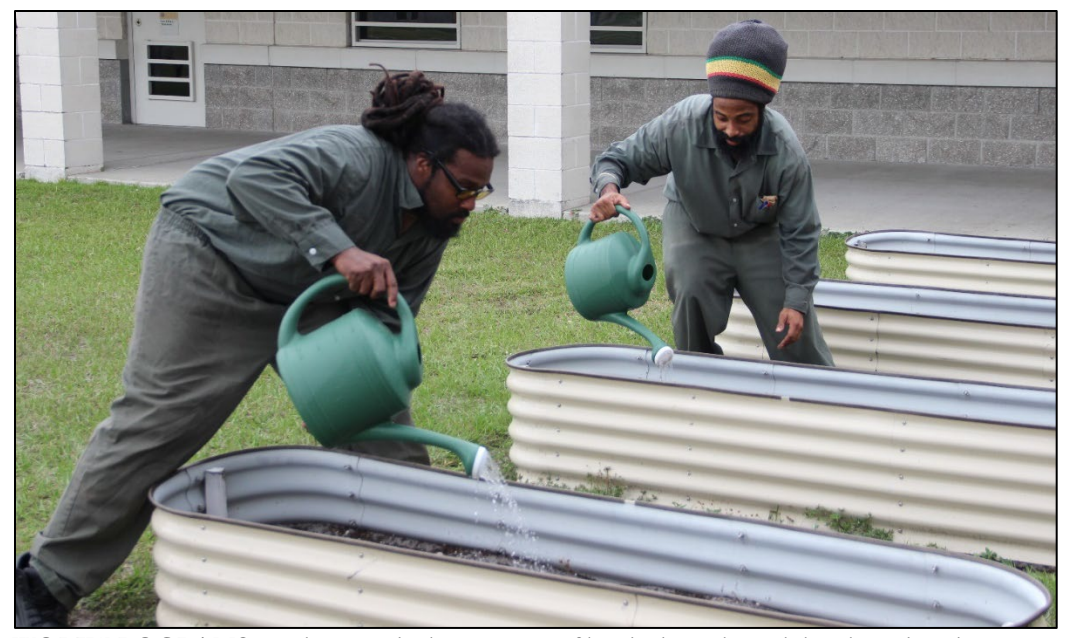
WORK PROGRAMS. Students apply the concepts of horticulture through hands-on learning at FCC Coleman in Sumter County, FL.

BOP has already begun expanding programs and hiring staff to deliver the programs. While the FSA did not come with appropriated funds in FY 2019, the Deputy Attorney General announced in July 2019 that BOP had taken the initiative to adjust funding within its budget to cover a variety of targeted FSA activities, including: