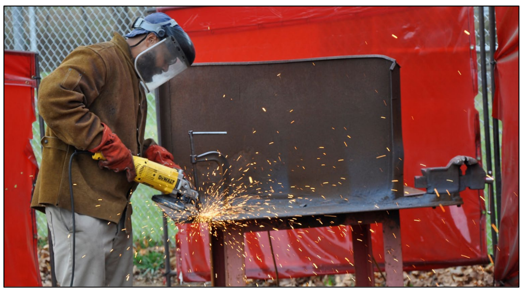
WORK PROGRAMS. A vocational student grinds a test plate that was welded in the Gas Metal Arc Welding (MIG) Process at FCI Morgantown.

BOP shares the stakeholders' concerns about program availability and is preparing to meet an anticipated increased demand as inmates will be eligible to receive incentives for completing programs.