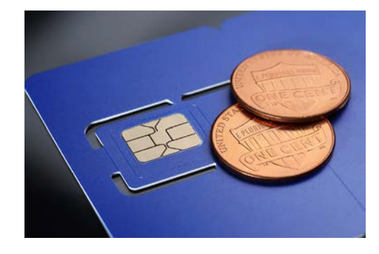
Figure 3: A nano-SIM card is smaller than a coin and easy to conceal and smuggle into and out of a correctional facility.