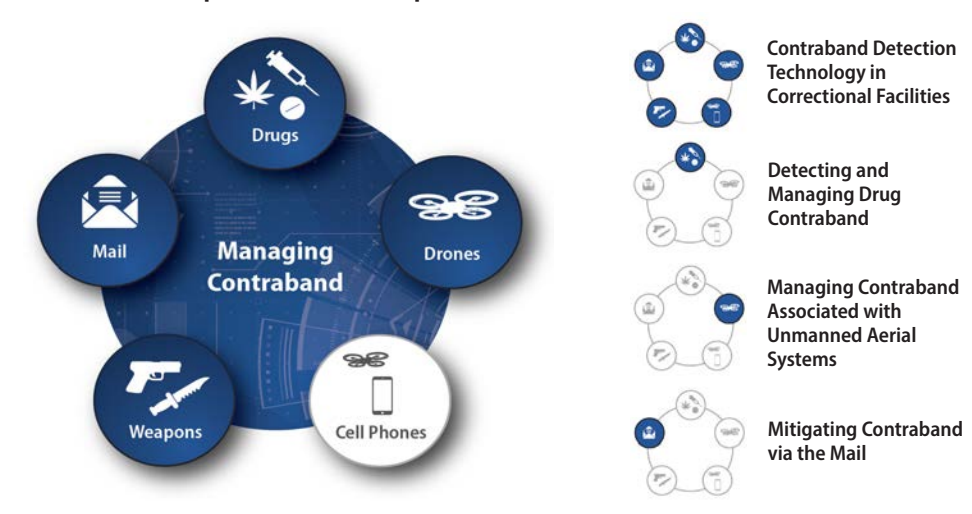
Figure 1: The successful management of cell phone contraband requires trade-offs related to performance, price, and operational issues.

This document explores cell phone contraband detection technologies. Additional documents in this series address specific contraband topics.