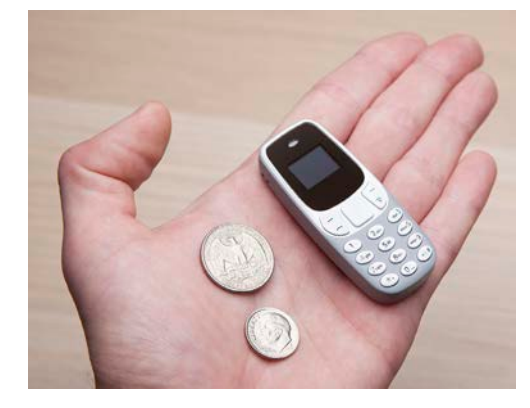
Figure 2: A mini cell phone approximately 5 cm in length is easily hidden, can transmit phone calls, and is Bluetooth capable.

Along with cell phones, associated chargers are commonly smuggled into correctional facilities; however, many prisons do not have electrical outlets in the cell block. Unlike in a home where outlets are readily accessible, inmates may need to devise ingenious ways to hook up chargers or manipulate existing 110-v power sources found in cells, commissaries, or